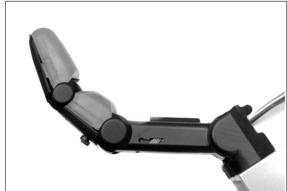
Figure 3. Shadow Finger Test Unit.

The Shadow Finger Test Unit is derived from the Shadow Dextrous Hand and allows research into the operation of compliant manipulators. The Shadow Finger Test Unit is driven by Shadow Air Muscles and allows all sensing capabilities used in the Hand system to be experimented with on a smaller scale.