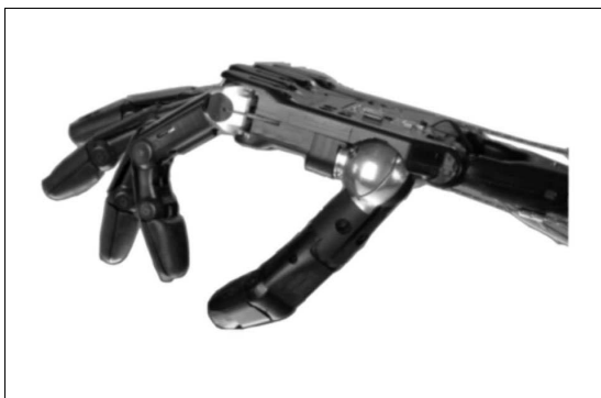
Figure 2. Shadow Dextrous Hand.

The Shadow Dextrous Hand is the first humanoid robot hand unit commercially available offering 25 degrees of freedom and optional tactile sensing embedded in all fingertips. It offers specific advantages in that it has been designed as a modular solution to robotic manipulation requirements.